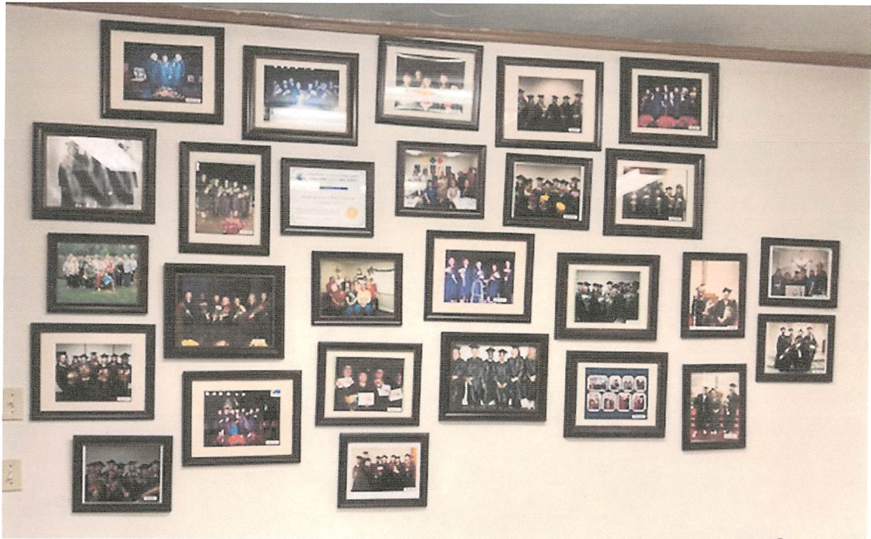
Our "Wall of Fame" – pictures of our graduates