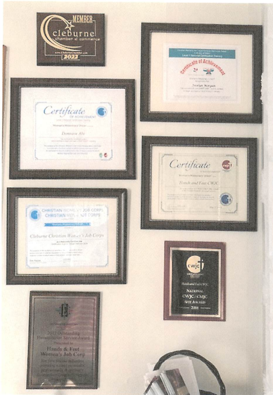
Some of our certifications and recognitions